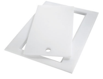
PLANCHE DE DECOUPE DOUBLE HDPE A644 A01