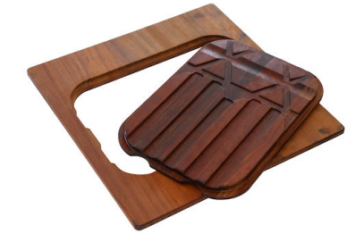
PLANCHE DE DECOUPE DOUBLE IROKO A644 F04